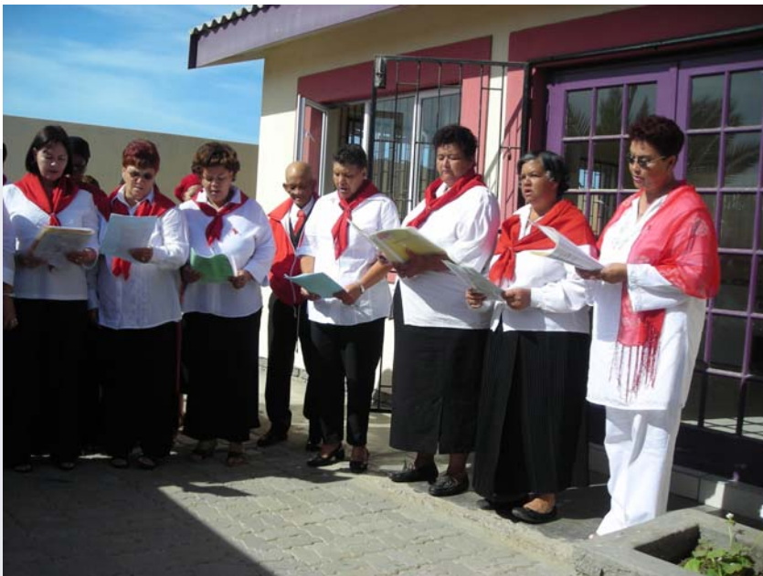
A choir sings when a HIV/AIDS clinic is opened in Walvis Bay, a Namibian harbor town, in 2007.

The decentralization of health management resulted in new priorities for the healthcare sector. In 1994, the government created 13 Regional Health Management Teams to